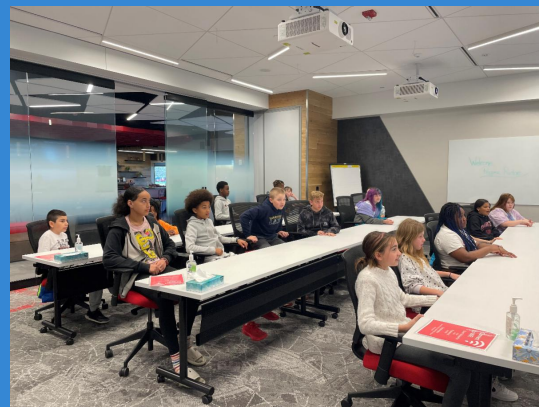
Pepper Ridge 5th graders learn about technology and related careers from STEM volunteers.

As part of the "Opening Doors" program sponsored by Promise Council, 5th graders from Pepper Ridge visited State Farm's b'link facility on Tuesday, April 18th. The Opening Doors program was created to help fifth grade students envision their futures in ways they may not have considered. The possibilities of attaining a higher education, potential careers, and vocational skills are introduced. "Social and Emotional Learning Competencies" are also discussed to provide students with real tools to be their best self.